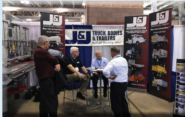
NJ League November 19-21, 2019 Atlantic City, NJ