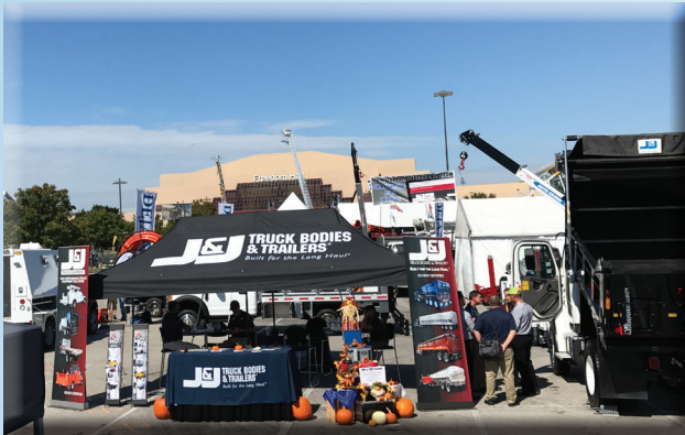
ICUEE October 1-3, 2019 Louisville, KY