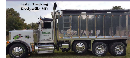
Laster Trucking Keedysville, MD

UNDER THE LENS CUSTOMER-SUBMITTED PHOTOS