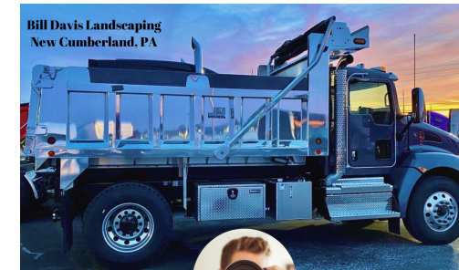
Bill Davis Landscaping New Cumberland, PA

Our fully equipped repair facility and dedicated parts department offers customers an easy and fast way to keep your trucks on the road.