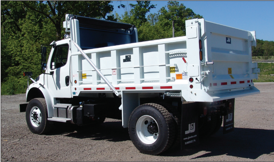
Sherwin-Williams Genesis® paint system provides a high gloss, extremely durable and resistant finish. All steel bodies are completely sandblasted for superior paint adhesion.