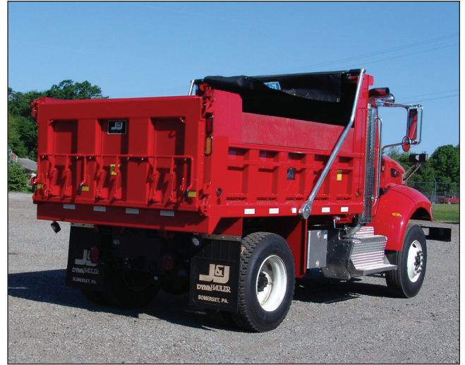
Let J&J put together a dump body package that suits your application.