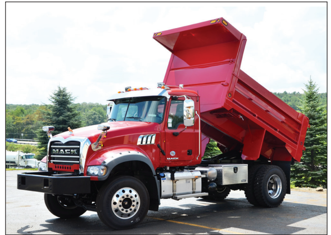
J&J also builds medium-duty dump bodies that feature horizontal formed sides and optional crossmemberless understructure with V-press bend sides.

For a complete list of options, call J&J today!